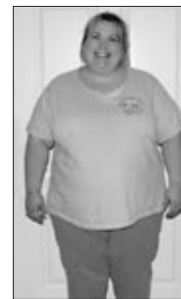
Before 307 lbs.