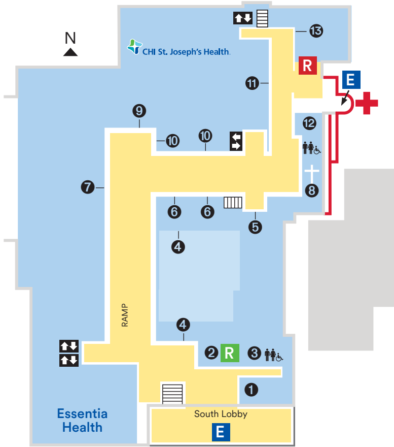
CHI St. Joseph's Health Main Level Way Finding Map